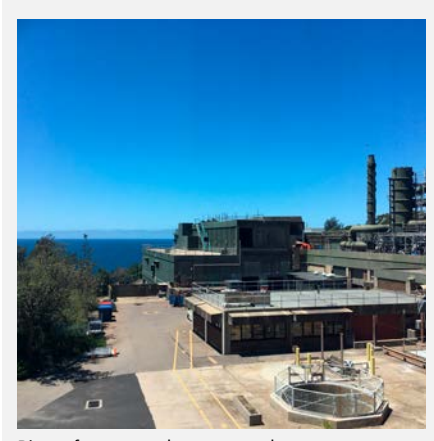
Biogas from treated sewage used to generate electricity at North Head Wastewater Treatment Plant, Sydney, Australia.