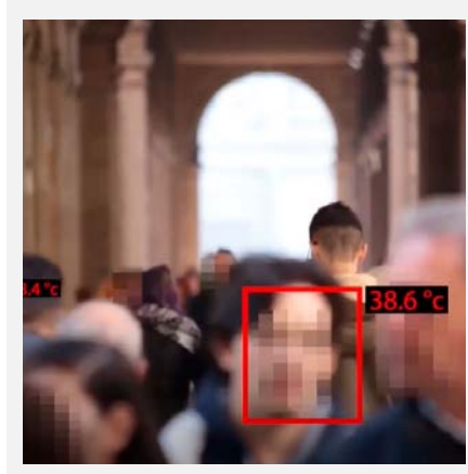
Artificial Intelligence camera vision for COVID-19 fever detection in crowds. © Marlene Kanga