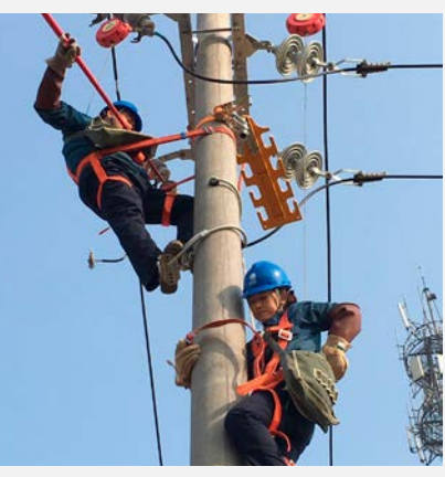
Engineers are essential for designing, building and maintaining power infrastructure.