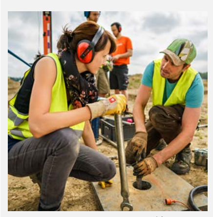
Geo-engineering innovation is essential for discovering and protecting the Earth's resources.