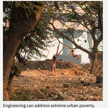
How engineering can make it happen

Engineering drives economic growth and alleviates poverty through basic infrastructure such as roads, railways and telecommunications. However, much engineering work