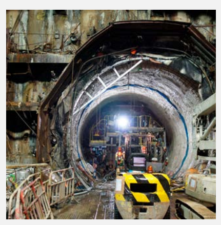
How engineering can make it happen