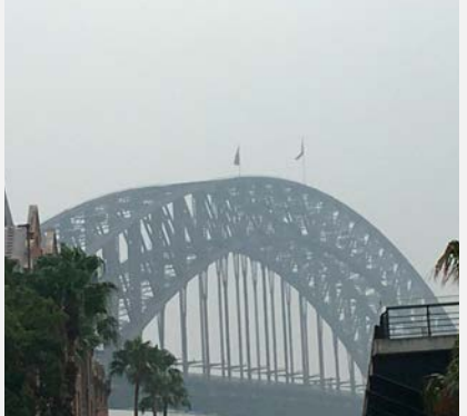
The impacts of climate change, caused intense bush fires and smoke haze over Sydney, January 2020.