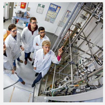
Students developing innovations in chemical process engineering.